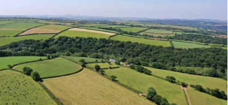
The land extends in all to approximately 22.28 acres comprising ancient woodland, largely undisturbed for many hundreds of years, with a pretty stream boundary.

Liskeard Farms & Land Agency liskeard@kivells.com | 01579'345543