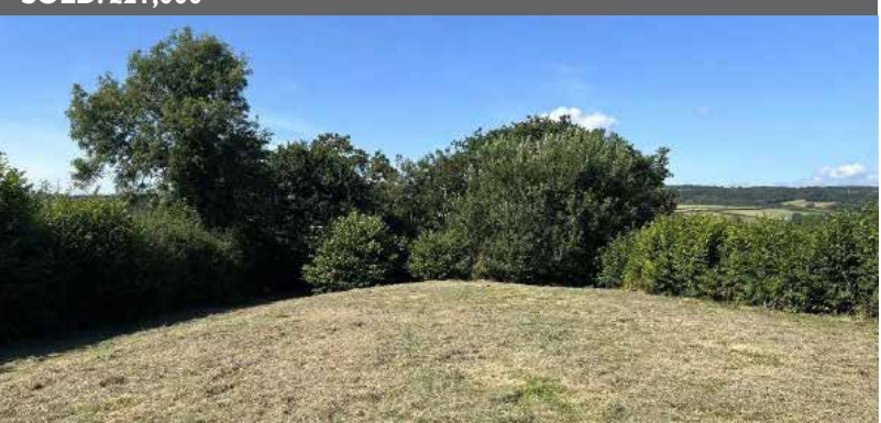
A pretty little paddock of 0.33 acres in a very private position with far reaching views. Would make a perfect garden, orchard or to use for occasional camping.

Land at Berry St. Dominick, Saltash | Auction Guide Price £15,000 SOLD: £21,000